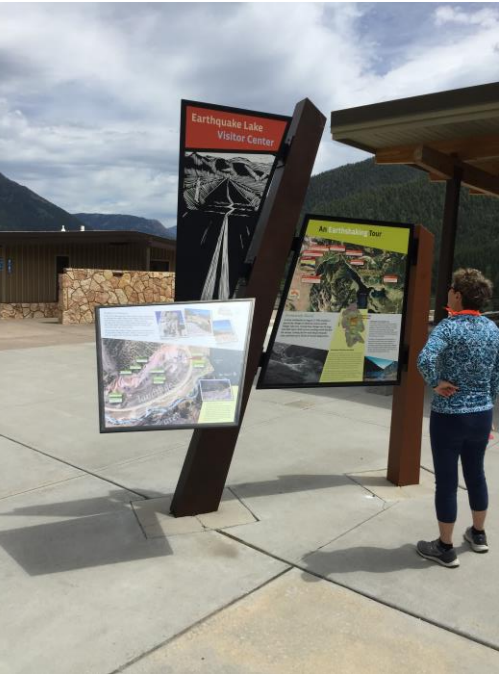
Earthquake Lake Visitor Center