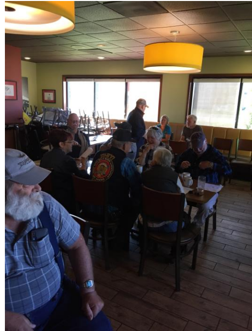
Chapter E gathering